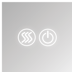
Touch sensors for light and demister

While we aim to ensure specifications are correct at the time of publication, Fienza reserves the right to make modifications without prior notice. Physical colour may vary from image shown. All measurements are shown in millimetres. Always use physical product measurements for mark-ups and roughing-in as the technical drawing may differ from actual product received.