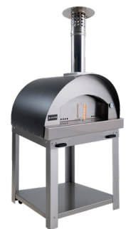
Wood Fired Pizza Oven + Pizza Trolley EPZ60BBS ETR600P