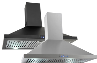
90cm Alfresco Canopy Rangehood Black EBB900BK3R S/Steel EBB900SS3R