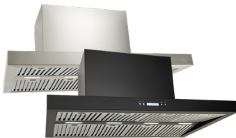
120cm Alfresco Canopy Rangehood Black ERB120BK3R S/Steel ERB120SS3R