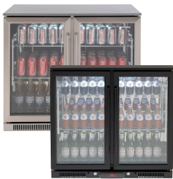
208L Beverage Fridge - Double Door Black EA900WFBL S/Steel EA900WFSX2