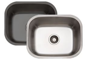
510x440 Undermount/topmount Sink EAS510UM EAS510UML