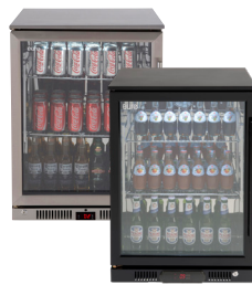
138L Beverage Fridge - Single Door Black EA60WFSX2L/R S/Steel EA60WFBL/R