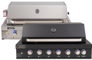
Built in BBQ and Hood - 6 Burner Black EAL1200RBQBL S/Steel EAL1200RBQ

We offer a specialised range of alfresco appliances and accessories to ensure the perfect fit for your alfresco kitchen.