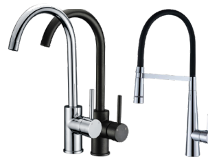
Sink Mixer - Flexible or Gooseneck Gooseneck PC1001SC PC1001SB-B Flexible PK1002-L EMT1094B