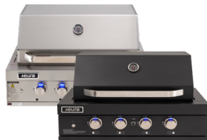
Built in BBQ and Hood - 4 Burner Black EAL900RBQBL S/Steel EAL900RBQ