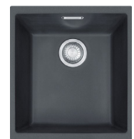
365x440 Undermount Carbon Sink SID-110-34 CB