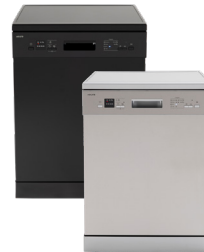
60cm Freestanding Dishwasher Black ED614BK S/Steel ED614SX