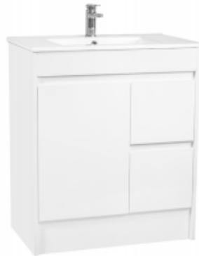
750mm - #K-PF750