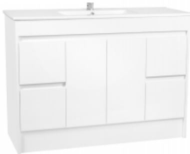
1200mm - #K-PF1200