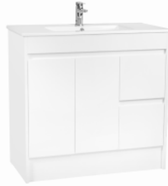
900mm - #K-PF900