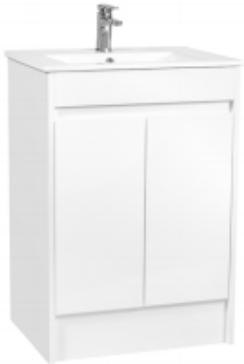
600mm - #K-PF600