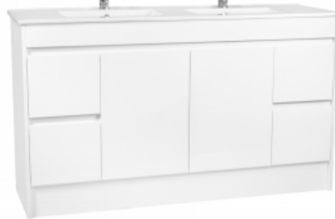
1500mm - #K-PF1500