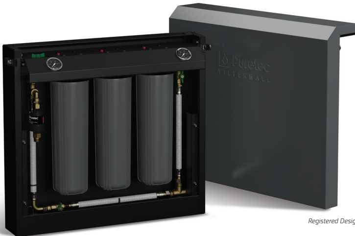
3-Stage Filtration System with bypass and PVM